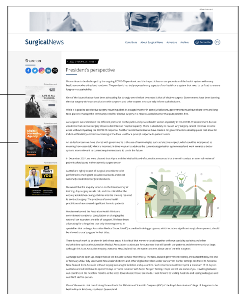
Article ad 1 234 X 234px