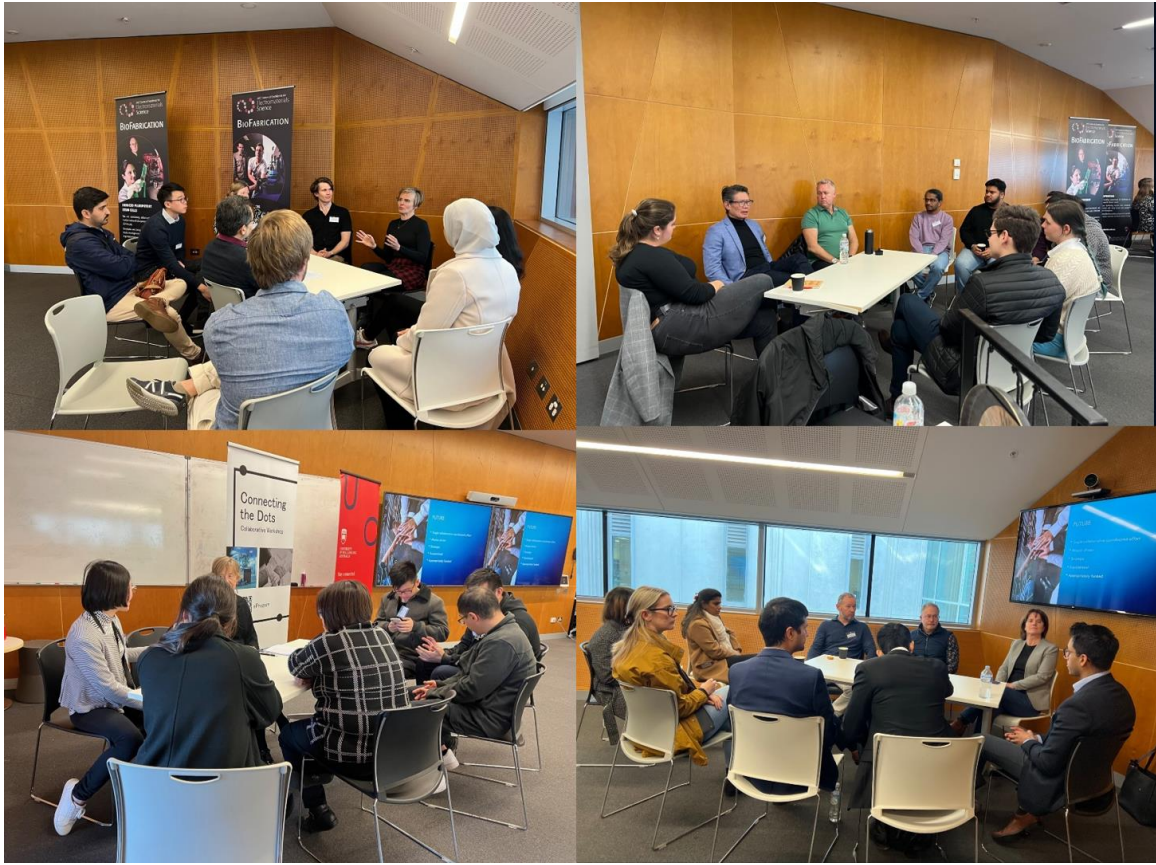
Connecting the Dots: Students were split into 4 groups to facilitate mentorship: career development, entrepreneurship, engagement with Federal bodies, policy and system engagement.