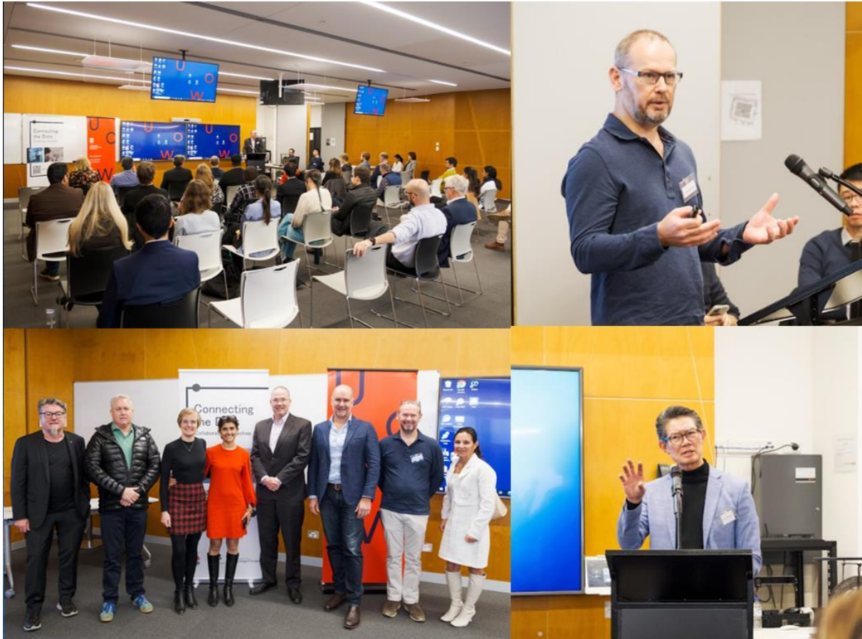
Our Connecting the Dots event brought together state and federal collaborators in science, surgery, industry, government and philanthropy to raise the importance of interconnectivity in research translation. Training in interdisciplinary research was seen as key to supporting early- and mid-career researchers.