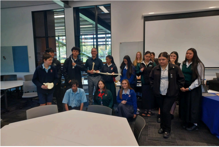
Pūhoro session in Auckland