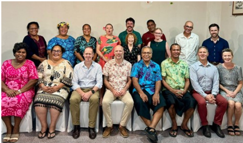
RACS Global Health Volunteers and Staff in Tuvalu with Government Ministers, senior Health staff and members of the Australian High Commission