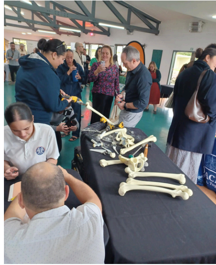
Te ORA Careers Day