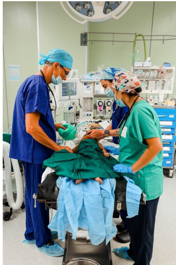
RACS Global Health Volunteer Paediatrics Team delivering surgery in Samoa