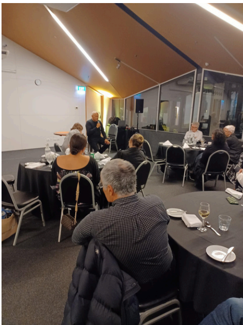
Hui-a-tau dinner August 2024

The Te Rau Poka research project has been completed, with a final report being presented to the Māori Health Advisory Group in November.