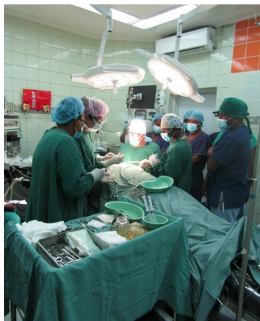
RACS Global Health Volunteer Team delivery specialist ENT surgery in the Solomon Islands