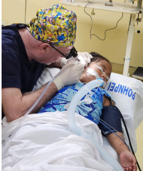
Senior Clinician delivering specialist surgery on the island of Pohnpei in the Federated States of Micronesia

-Total of 450 including 112 non-PCSHWHIP