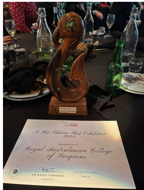
RACS award from the te ORA Maori Medical practitioners conference September 2024